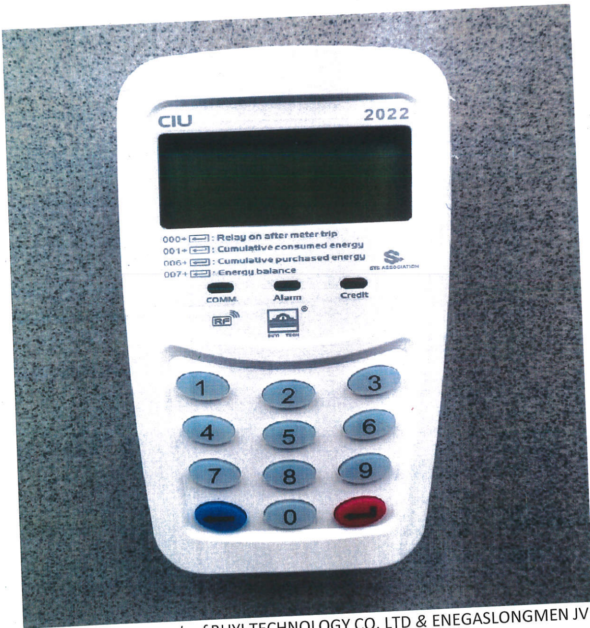
Above is a photograph of BUJI TECHNOLOGY CO. LTD & ENEGASLONGMEN JV LTD Single Phase Two Wire Smart Prepayment Energy Meter Customer Interface Unit (CIU).